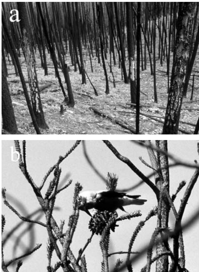
Figure 1. (a) Marks on burned trees left by woodpeckers that fed extensively on wood-boring beetle larvae in the snags. (b) Clark's Nutcracker ( Nucifraga columbiana ), a postfire specialist that has evolved a sublingual seed pouch that can hold more than 100 seeds, is extracting seeds from an underappreciated seed source—severely burned ponderosa pine.

Even if the spatial scale over which stand-replacement fires occur in the lower-elevation conifer forest types is greater now than in the historic past, that is not to say that the presence of crown fires represents a process that is unnatural. Severe fires are clearly natural, and they constitute an important part of the fire regimes associated with most western conifer forest types (Arno 1980;