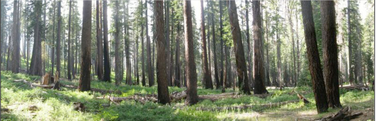
Illilouette Basin, Yosemite National Park.