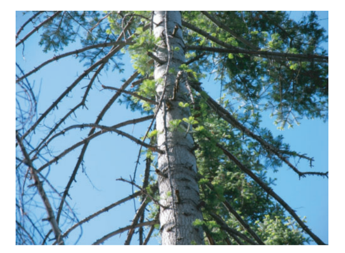
Fig. 1. Epicormic branching on a > 50 cm diameter at breast height Abies concolor , July 2005.

within a severely burned area in the Tahoe National Forest (Fig. 1). Our goal in the present study was to compare the relative density of white fir with epicormic branching between two size classes, and compare the percentage of the tree bole with sprouts to the extent of crown loss. We used percentage remaining green crown as an indirect measure of fire effects on a tree, which can include bole heating, foliage loss, insect attack, and physiological stress (Ryan and Reinhardt 1988; Stephens and Finney 2002; McHugh and Kolb 2003; van Mantgem et al. 2003).