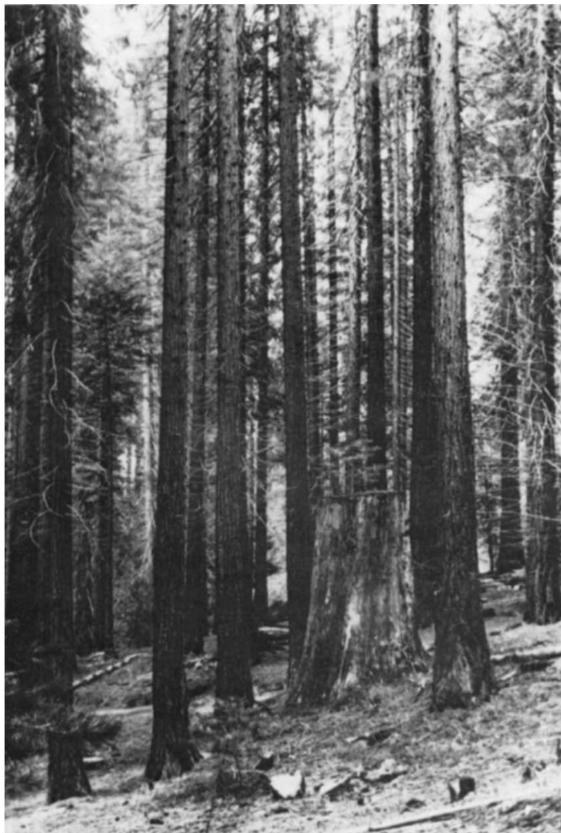
Fig. 1. Whitaker's Forest, showing the stand structure of young-growth giant sequoia. The stump in the foreground is a remnant of a large diameter sequoia cut in the 1870's.

fuel moisture analog was used in his study to emphasize management application. Fuel moisture indicator sticks are still the most widely used estimators of moisture in medium (1–10 hour) timelag fuels. Residual fuel was measured on paired subplots because of the destructive sampling necessary