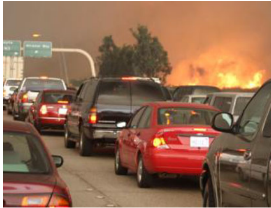
Figure 3. Thousands of evacuees heading north on the I-15 Freeway, just south of the Miramar Way off ramp. They are cut off with no escape as the Cedar Fire blew across the Freeway early Sunday morning of October 26, 2003, on the Marine Corps Air Station Miramar property. There were just as many stranded vehicles in the south bound lanes that are not shown. A sudden shift in the wind would have burned thousands trapped in their vehicles. In this case, fortunately no one was burned over. Do evacuees present a liability to local governments when mass evacuations are ordered and the evacuees are burned over while trapped on clogged roads and freeways resulting in numerous fatalities?

Defending although this new policy acknowledges that some residents will elect to stay behind and that they should be properly equipped and mentally and physically prepared to actively defend their homes if they do decide to Stay and Defend. Once it is safe to do so, residents that stayed behind are advised to thoroughly check their home, yard, roof, attic, etc. for ember fires; and to use a hose or fire extinguisher to suppress any spot fires or smoldering embers. To be considered an SIP community, the entire community must be designed to withstand heat, flames, and embers from an approaching wildfire (see also [4]). This means that every home must share the same ignition-resistant design elements, including a well-maintained fire district approved vegetation management plan. An additional feature is the on-going requirement to continue to maintain all fire resistant landscaping and ignition-resistant housing components in perpetuity.